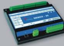
Knocking detector DENOX