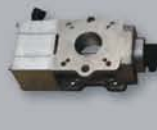
Gas Throttle Valve