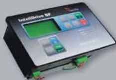
Bi-fuel controller IntelliDrive BF